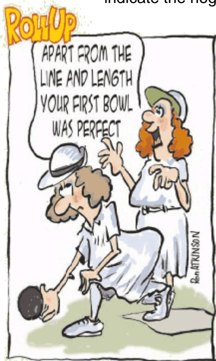
Cartoon by Ako - www.lawnbowlishypnosis.com

Hog Line: an imaginary line 21 metres in front of the mat, which is the minimum distance a jack must be thrown in order to start an end. Markers at the edges of the bowling green indicate the hog line, given that a mat is placed 2 metres from the ditch.